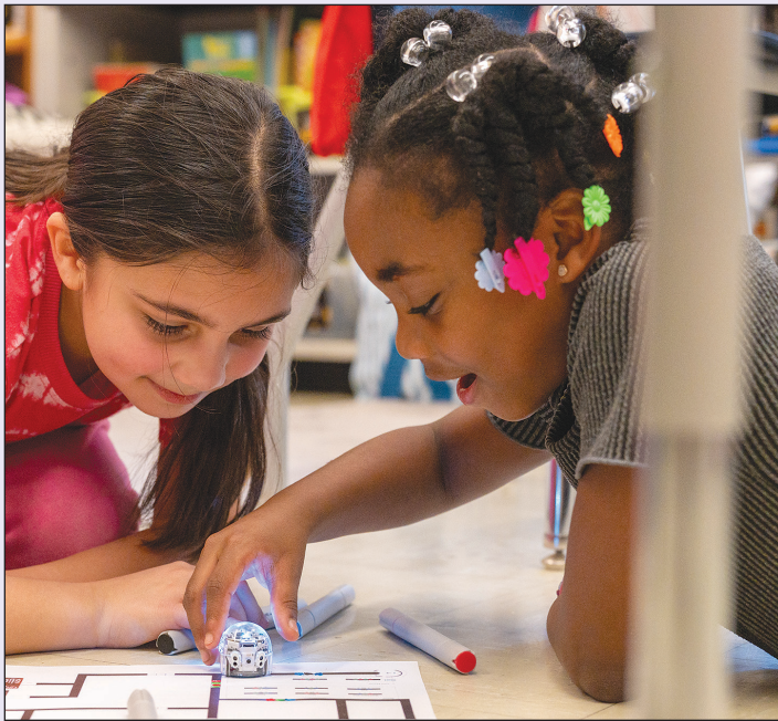
Robotics is a hit with students at School 2 on STEAM Day in January. These days held throughout the year allow students to explore science, technology, engineering the arts and math with hands on activities related to classroom lessons.