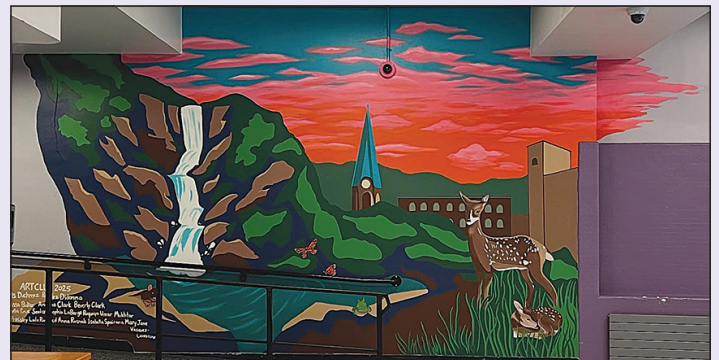
THS Art Club painted a mural in the cafeteria last summer.