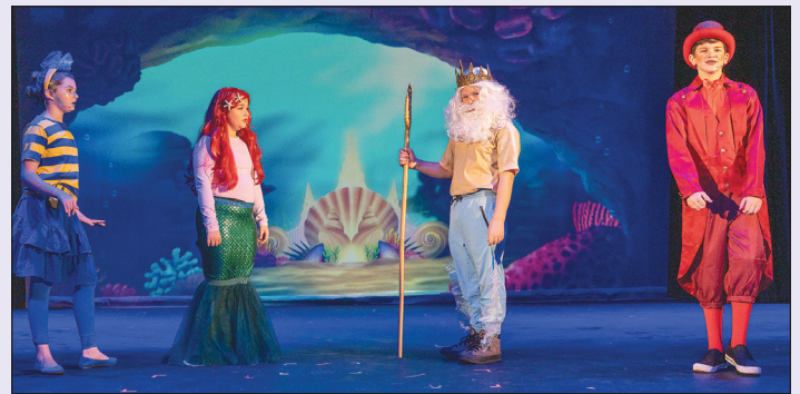
The TMS Drama Club performed Disney's "The Little Mermaid Jr." in November.

Varsity Football brought the Collar City Cup home from LaSalle and returned to the Class A Super Bowl, finishing the season 8-3. Girls Basketball reached the Section 2 title game, falling to Bethlehem 58-56 in the final seconds. Boys Basketball made a deep sectional run, reaching the semifinals before falling to Amsterdam.