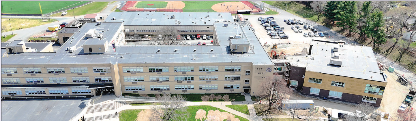
The new Technology Wing at THS is due to open in September 2026

BOARD OF EDUCATION ELECTION: Three seats on the Board of Education are open for three-year terms beginning July 1, 2026. Please see our website for the biographies of each candidate.