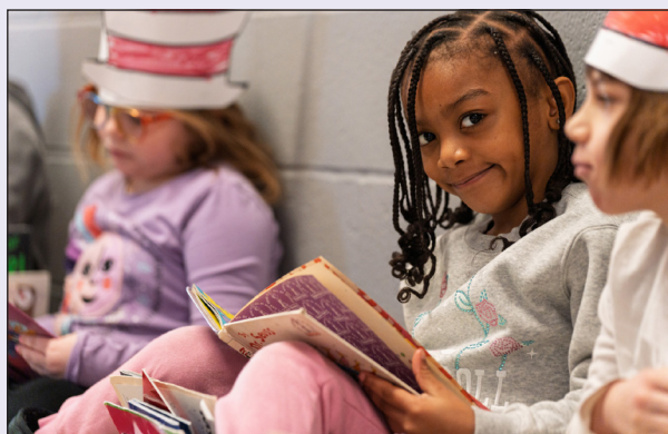
Carroll Hill held a school-wide reading chain to celebrate Read Across America Day in March

Student artwork was once again on display across the state at exhibits including the Troy Victorian Stroll, the New York State Art Teachers Association Exhibit at the NYS School Boards Association Convention, the 34th Annual Legislative Student Art Exhibit, and more. In addition to these exhibits, Troy students painted two new murals at the Troy Atrium, adding vibrant colors to the Troy Farmers Market indoor space.