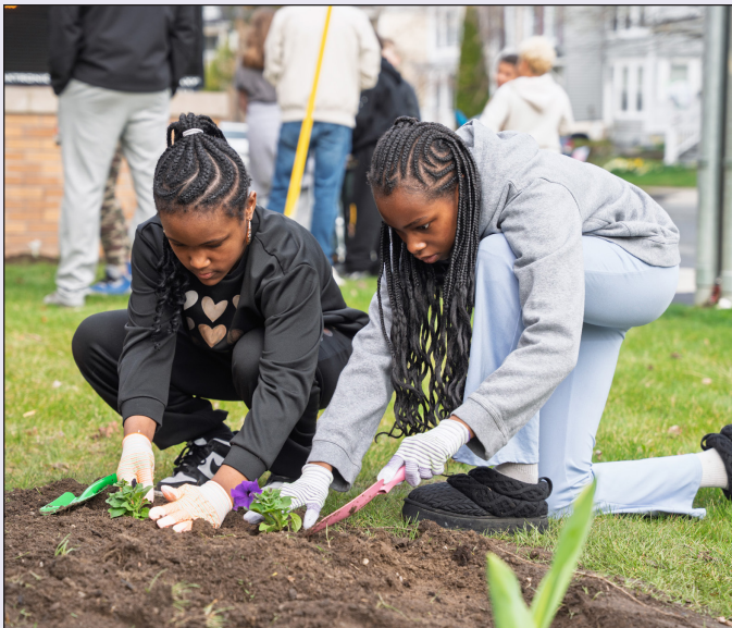
Fifth graders at School 16 planted flowers and cleaned up litter to celebrate Earth Day with the PTA