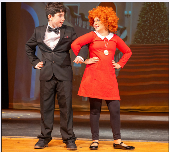
TMS students performed "Annie Jr." last fall