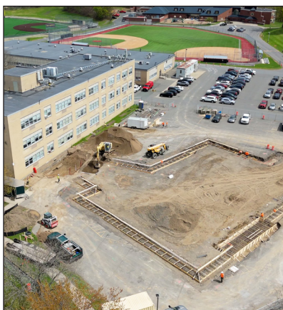
Construction on the new THS Technology wing began in April.