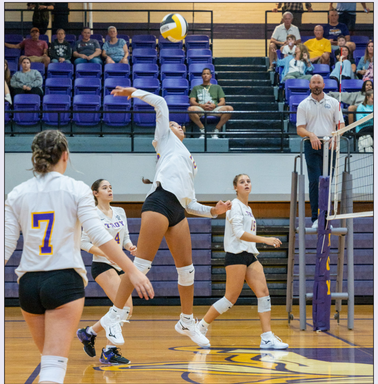
The Varsity Girls Volleyball team was one of 11 teams to earn the NYSPHSAA Scholar-Athlete designation for the fall and winter seasons.

This year's 1.75% proposed tax levy increase is below our allowed limit and adds approximately $5.25 per month for a home assessed at $160,000, helping us maintain essential programs without layoffs.