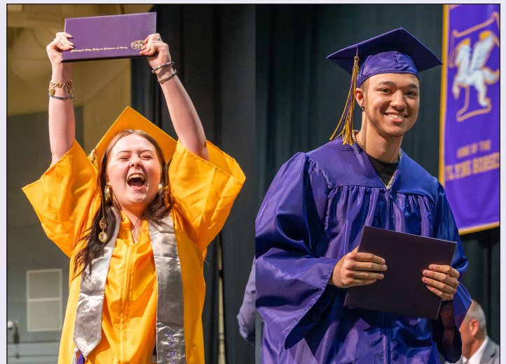
Troy High School celebrated its 165th Commencement on June 28, 2024.