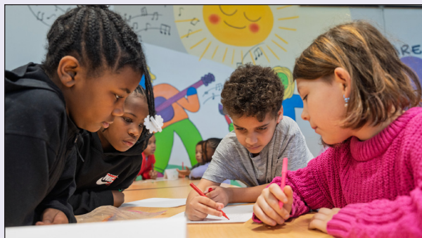
School 2's second annual Math Sprint competition encouraged students to work together to solve math problems