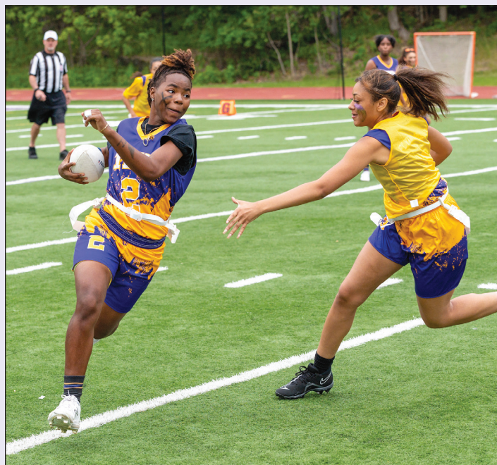
Troy High fielded the only Varsity Flag Football team in Section 2 last year.