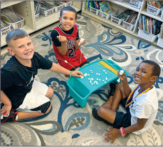
Carroll Hill students demonstrating a growth mindset, working together to solve various problems.

The local share of this project will be funded through the Capital Reserve previously approved by the voters. This will allow for this significant project to be completed with no tax increase and will ensure our facilities are well-maintained for years to come.