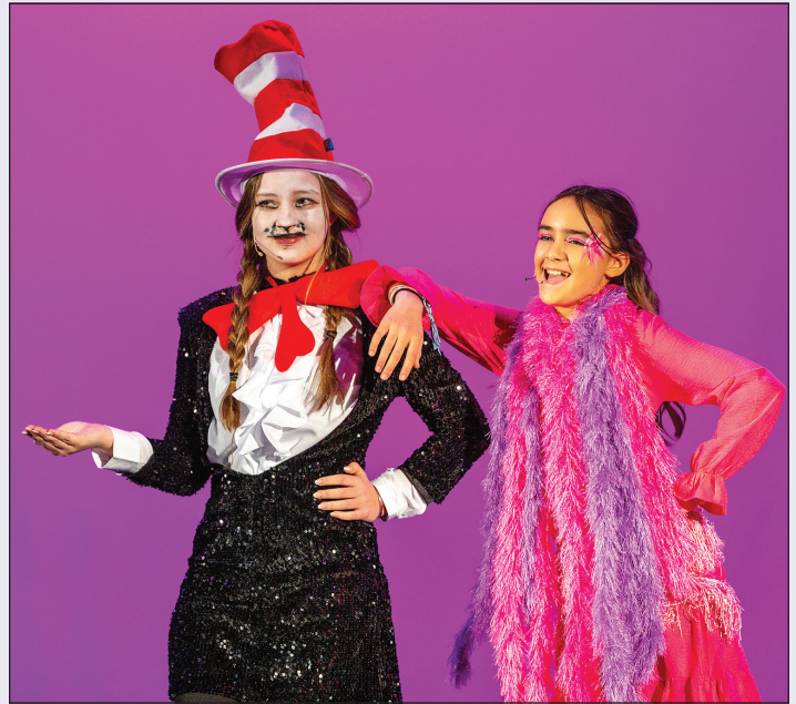
In November, Troy Middle School students performed "Seussical Jr.," their first Drama Club production.

Along with a full complement of winter concerts in December, and the annual Troy High Pops Concert in February, Troy also hosted the Rensselaer County School Music Association Winter Festival in January. We were honored to welcome student musicians from each school in Rensselaer County for a day of excellent performances from the Elementary Band, Junior Choir, Orchestra, Chamber Choir and Senior Band.