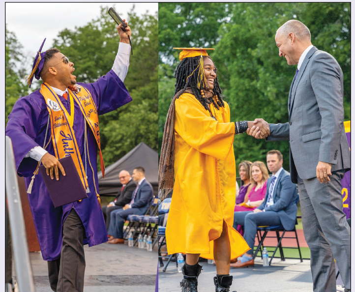
Troy High School celebrated its 164th Commencement ceremony on June 23, 2023.

This budget minimizes the impact on our programs and staffing despite the changes to school funding at the state level. Although Troy CSD received significantly less state aid than expected, this budget contains