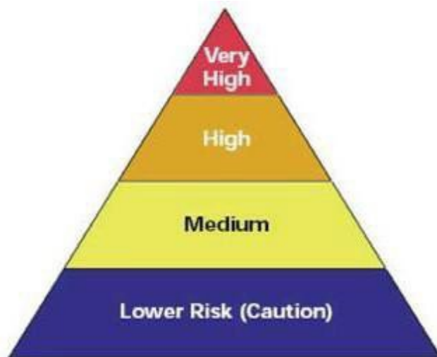
Occupational Risk Pyramid

( https://www.osha.gov/Publications/OSHA3993.pdf )