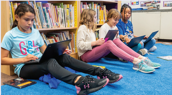
Elementary students studied all aspects of coding in the library during Computer Science Month in December.

As we have said over the past several years, the federal stimulus funding we've received since 2020 through the American Rescue Plan will end after the 2023-2024 school year. However, thanks to our long-term, strategic financial planning, we are prepared for these funds to be discontinued. The 2023-2024 school year is also the third and final year of New York State's Foundation Aid phase-in, so while we have seen significant increases in Aid each year since 2021-2022, these increases will likely not continue at the same rate beginning in 2024-2025. The Troy City School District remains committed to providing its students with a high-quality education that prepares them for success in the future.