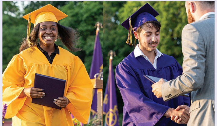
Troy High School graduated 237 seniors at the ceremony on June 24, 2022.

This budget adds two new elementary teachers, one each at School 2 and School 18. Most of our elementary classes have less than 20 students, and we are pleased to be able to make staff additions to support small class sizes and reduce our largest cohorts in those buildings.