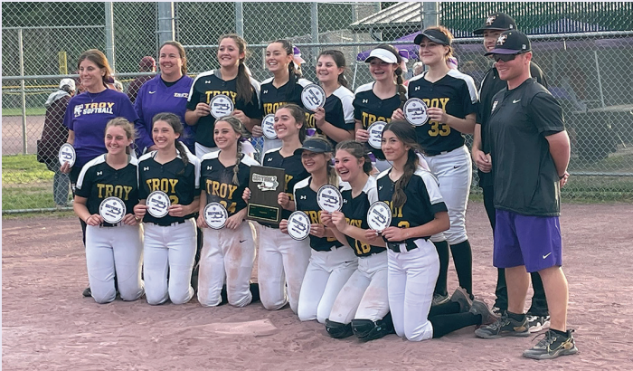
Last season, Varsity Softball made it to the NYS Final Four with a record of 22-3.