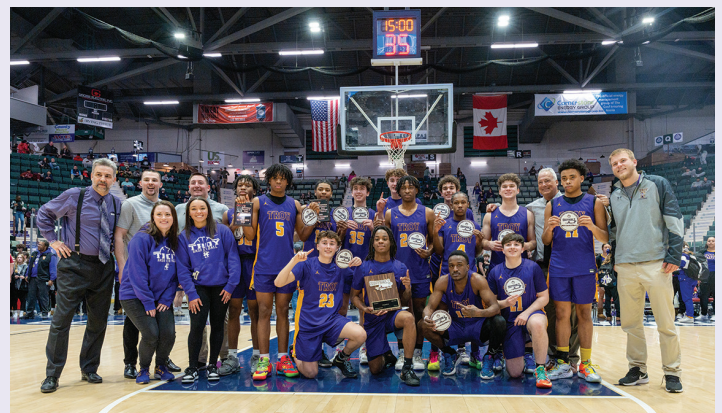
Varsity Basketball claimed the Section 2 Class A title over #1 seed Amsterdam in March.

We are proud this year to have nine sports teams named Scholar-Athlete teams by the New York State Public High School Athletic Association - Golf, Football, Girls Cross Country, Girls Soccer, Girls Swimming, Girls Tennis, Girls Volleyball, Bowling and Girls Indoor Track. We also had 117 students named individual Scholar-Athletes for the fall and winter seasons. Last spring, Varsity Baseball, Softball and Girls Outdoor Track were named scholar-athlete teams, and we had 36 students named individual Scholar-Athletes.