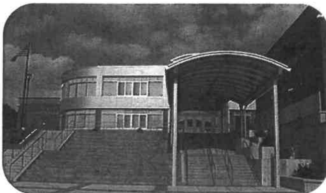
Troy Middle School 1976 Burdett Avenue