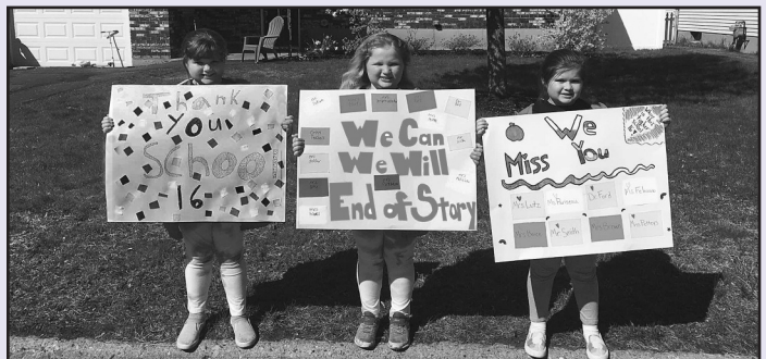
School 16 students proudly display the signs they made for the staff car parade during the COVID-19 closure. "We Can. We Will. End of Story."

"This has no doubt been the most difficult budget to develop since I've been superintendent, but I am confident in our caring and dedicated staff and the district's ability to provide a quality and comprehensive education to all students in Grades Pre-K through 12. We will get through this together and I thank the community for their support, especially during difficult times like these."