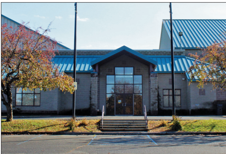
This plan calls for the purchase of the current Neff Athletic Center to be renovated and turned into the Troy Community School.