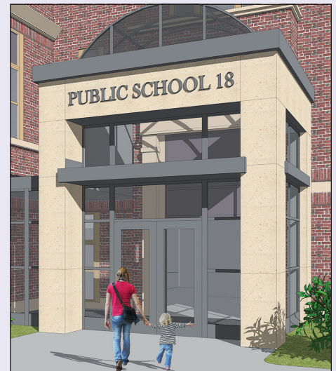
3D renderings of the secure vestibules and exterior renovations to be added to School 16 and School 18.