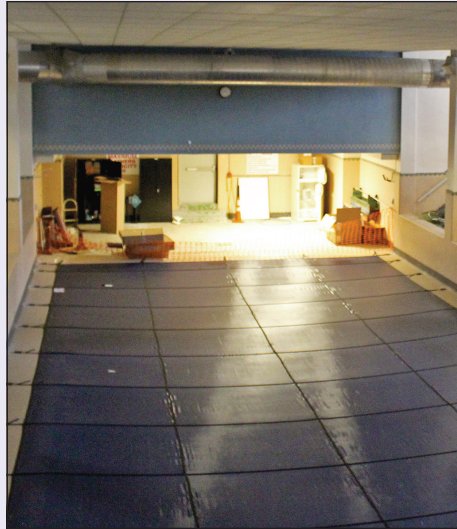
Pool areas at School 12, School 14, School 16 and School 18 to be renovated for additional office and/or learning space.