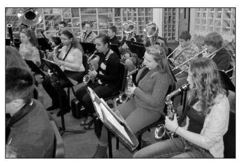
Students practice for the Spring concert in the acousticallydesigned band room.

acoustically-designed band room, chorus room, ensemble room, three practice rooms, two general music rooms, and instrument repair room as well as music lab. Troy's performing arts program is devoted to providing students with opportunities for diverse performances in school and in the community such as the collaboration with RPI for Earth Day Concert, The World Drum Project and Albany Symphony Orchestra's Heritage Series.