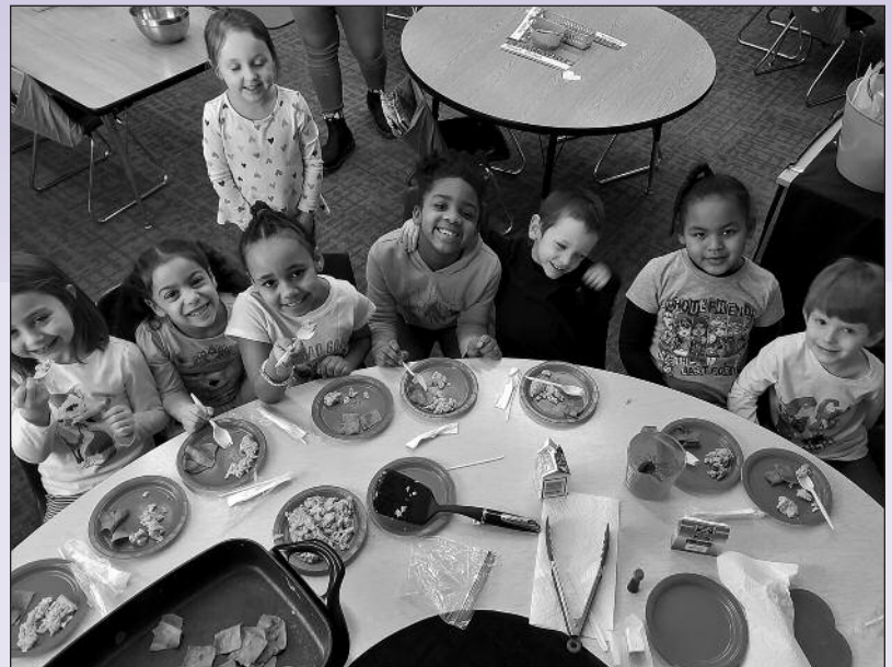
School 14 celebrated Dr. Seuss' birthday in March with green eggs and ham. During their writer's workshop, they wrote tutorial books on how to make the colorful breakfast.