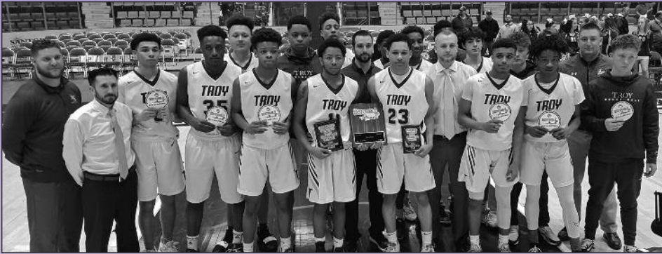
The Troy High School Basketball Team claimed the 2019 Section 2 Class A Championship, pictured here, as well as the 2019 NYSPHSAA Class A Regional East Championship.