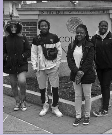
Troy High School College and Career Transition Liaisons provide additional exploratory programs available to every student to assist in our mission of graduating all students college and career ready. Pictured here, Troy High School students take a trip to The College of Saint Rose campus.