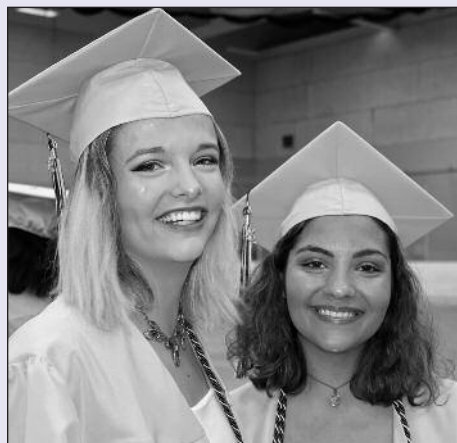
Troy High School's 2018 graduation rate is at 88 percent, up 15 percentage points in the past five years. Troy High School is also five percentage points above the statewide graduation rate, and 15 percentage points above the statewide average for urban-suburban high needs districts. Visit www.troycsd.org/graduation for additional figures.

This year, while still drastically underfunded, the District will receive enough State Aid to not only maintain its current