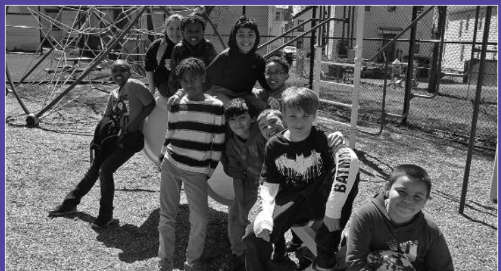
School 16 5th Grade students enjoying the playground on a sunny spring day. This playground, and four others, were included in Phase 1 of the 2016 Infrastructure Upgrade Capital Project.

The Troy City School District has some of the oldest schools in the area; with that comes the need for continuous maintenance and renovations to ensure safe and modern learning environments for our students. We thank you for your continued approval of the various projects we’ve already completed and for those still in progress. We are currently in the process of discussing projects for the 2019-2020 school year and beyond. Be on the lookout for exciting changes to come.