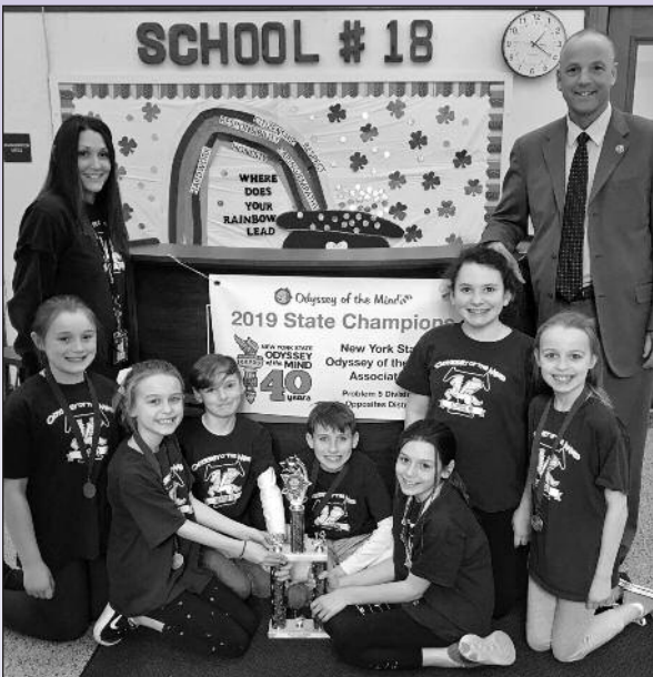
The School 18 Odyssey of the Mind team won first place at the state tournament held in Binghamton. The team advances to the World Finals to be held May 22 – May 25 at Michigan State University. This is their third appearance at the state tournament, and the first time the team has qualified for the World Finals.